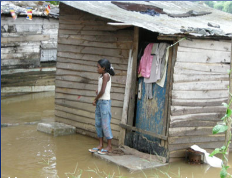
Unauthorised slum on a drain