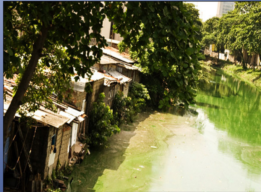
Unauthorised structures on a canal reservation