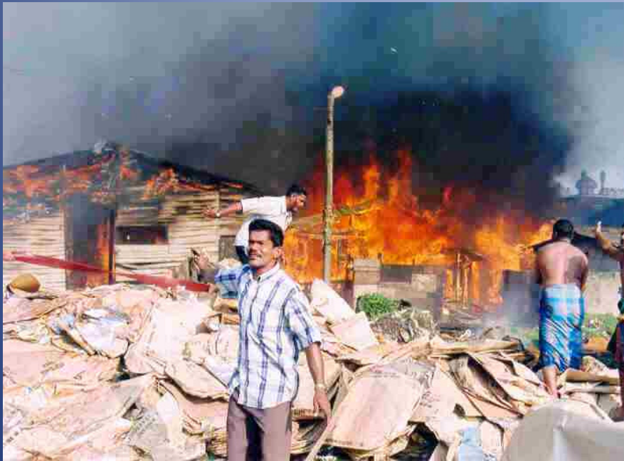
Fire in a congested slum area

Fire Services Department of the Colombo Municipal Council plays a major role during a disaster.