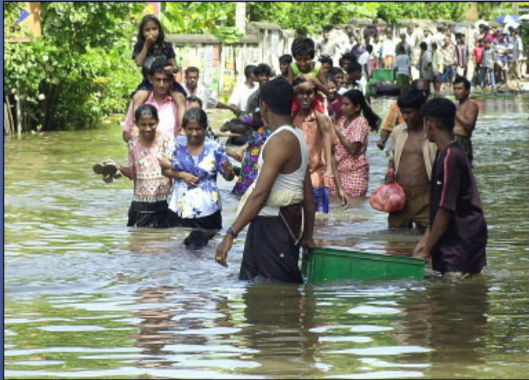
Flooding near to a canal bank