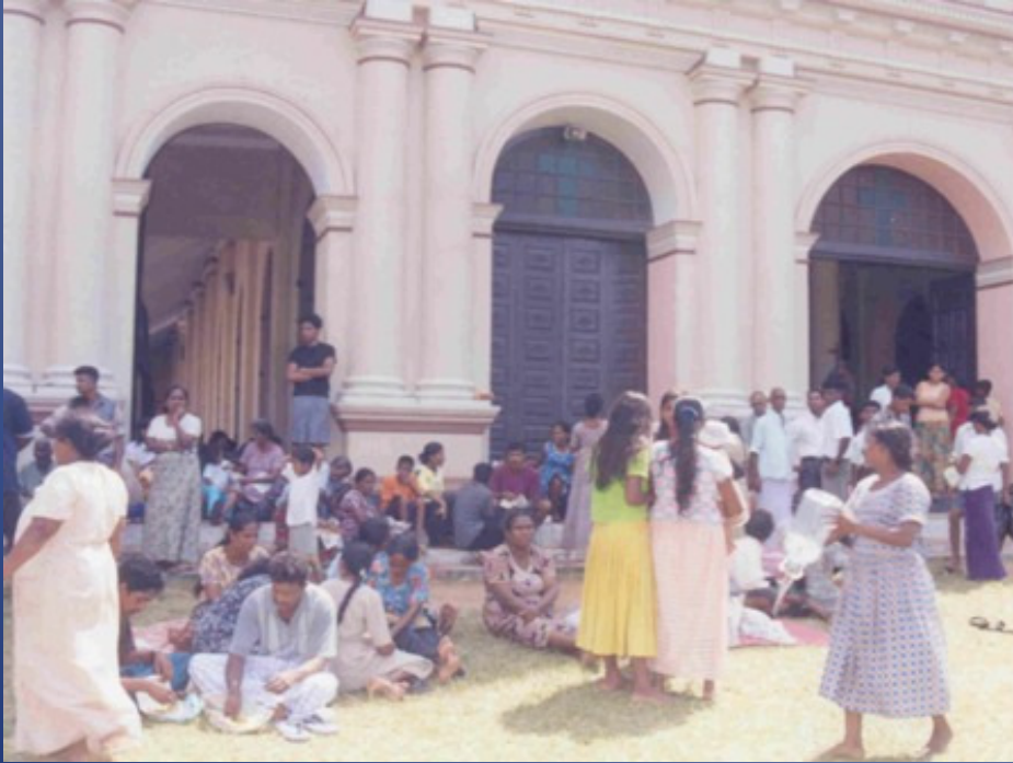
Centre to accommodate affected persons

The public assistance department of the Colombo Municipal Council provides relief services to those affected citizens during disasters and calamities.