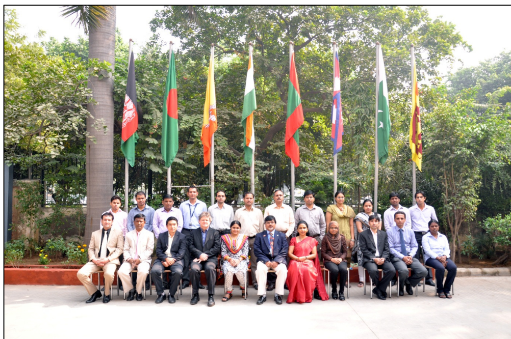
Participants with SDMC Team and UNISDR Resource Personnel